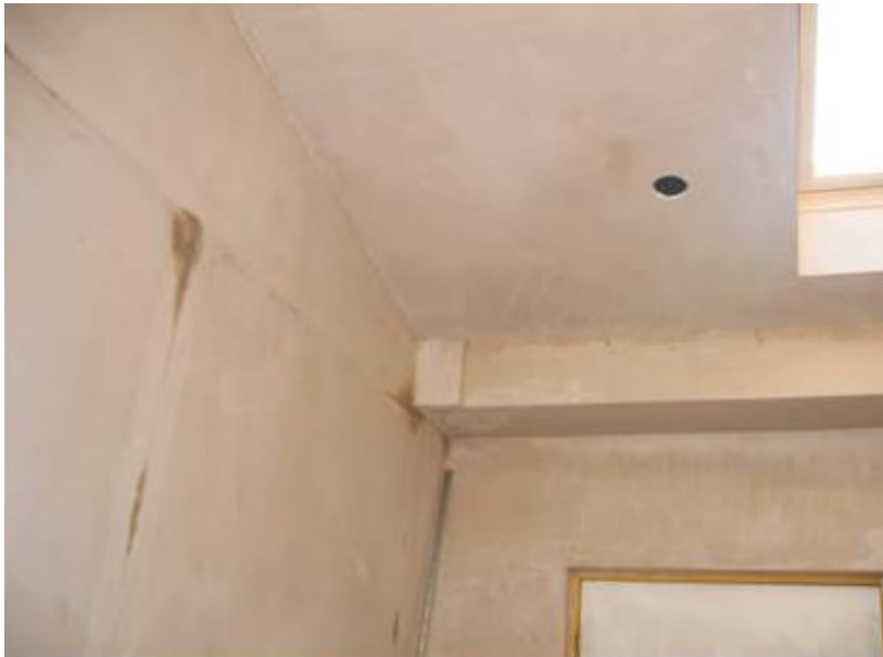
Ceiling Plastered and Decorated